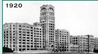
1920 "SEARS ON THE BOULEVARD" REGIONAL DISTRIBUTION CENTER SEARS, ROEBUCK AND COMPANY Philadelphia, Pennsylvania Irwin & Leighton's first project for Sears. The company successfully completed nearly 150 projects for Sears over the next 80 years.