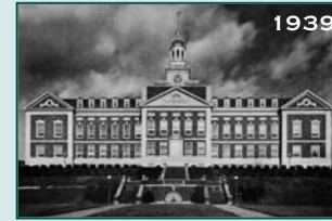
1939 BANCROFT HALL ADDITIONS & RENOVATIONS THE UNITED STATES NAVAL ACADEMY Annapolis, Maryland