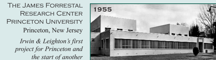
1955 THE JAMES FORRESTAL RESEARCH CENTER PRINCETON UNIVERSITY Princeton, New Jersey Irwin & Leighton's first project for Princeton and the start of another enduring relationship.