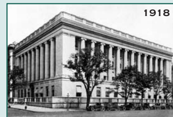
1918 THE UNITED STATES TREASURY ANNEX Washington, District of Columbia