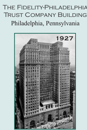
1927 THE FIDELITY-PHILADELPHIA TRUST COMPANY BUILDING Philadelphia, Pennsylvania