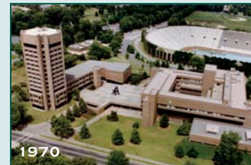
1970 FINE HALL/JADWIN HALL MATHEMATICS-PHYSICS COMPLEX PRINCETON UNIVERSITY Princeton, New Jersey Irwin & Leighton's first project on Princeton's main campus. In 2009, the University selected Irwin & Leighton to renovate Jadwin Hall.