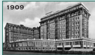
1909 THE HOTEL STRAND Atlantic City, New Jersey Irwin & Leighton's First Project