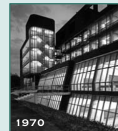
1970 WHARTON GRADUATE SCHOOL OF BUSINESS UNIVERSITY OF PENNSYLVANIA Philadelphia, Pennsylvania