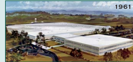
1961 OFFICE/WAREHOUSE MCGRAW-HILL INC. East Windsor, New Jersey Irwin & Leighton's first project for McGraw-Hill