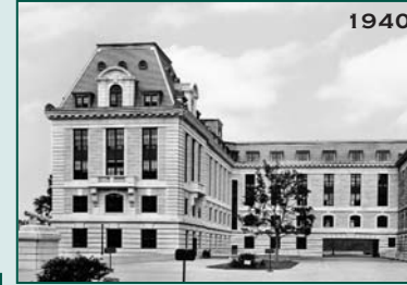
1940 FOUNDERS LIBRARY HOWARD UNIVERSITY Washington, District of Columbia