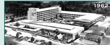
1962 MARRIOTT MOTOR INN/ KONA KAI RESTAURANT Bala Cynwyd, Pennsylvania

Construction Services Since . . . . 1909 . . . . . 1920 . . . . . 1930 . . . . . 1940 . . . . . 1950 . . . . . 1960 . . . . . 1970 . . . . .