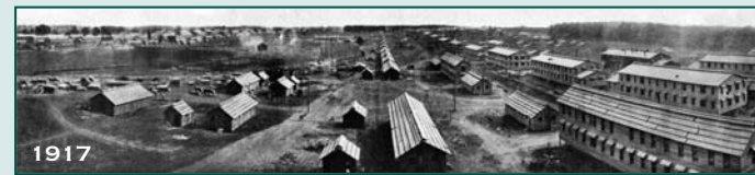
1917 THE UNITED STATES ARMY CANTONMENT AT CAMP DIX Wrightstown, New Jersey Substantially complete in 60 days!