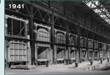
1941 PLANT EXTENSIONS BETHLEHEM STEEL COMPANY Sparrows Point, Maryland