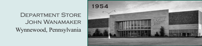
1954 DEPARTMENT STORE JOHN WANAMAKER Wynnewood, Pennsylvania In addition to seven stores for John Wanamaker, Irwin & Leighton completed many suburban projects during the 1950s and 1960s for other retail customers such as Strawbridge's, Sears, and Bonwit Teller.