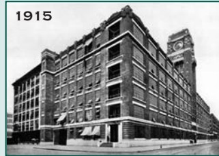
1915 CABINET FACTORY, THE "NIPPER BUILDING," VICTOR TALKING MACHINE COMPANY Camden, New Jersey The RCA relationship has been maintained by Irwin & Leighton for nearly 100 years through RCA's successors – General Electric and Lockheed Martin.