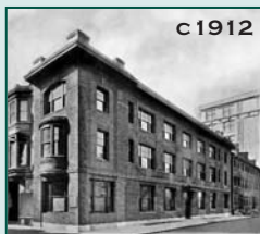
IRWIN & LEIGHTON'S FIRST HEADQUARTERS 12th and Cherry Street, Philadelphia, Pennsylvania The company soon moved to 1505 Race Street.