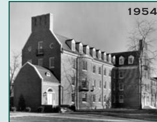
1954 MCKEAN HALL DORMITORY LAFAYETTE COLLEGE Easton, Pennsylvania Irwin & Leighton's first of many projects for Lafayette