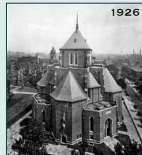
1926 IRVINE AUDITORIUM, UNIVERSITY OF PENNSYLVANIA Philadelphia, Pennsylvania